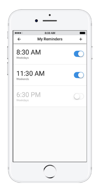
Stay motivated with daily reminders and achievable goals.